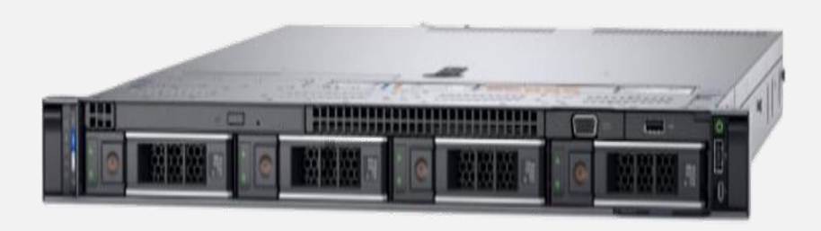
SIA USAM X Series (for illustration purpose only)

Designed to deliver unprecedented level of security in the cyber security space, SIA USAM X Series delivers Silverlake's cyber security products, services, support and maintenance - All in One.